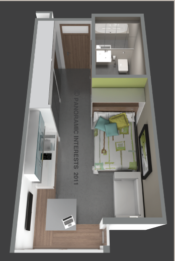
The Solo with a queen bed

The floor plans include: The Solo – a studio with a convertible bed/ table; the Duo – a studio with two twin beds; and the Suite – a 3 bedroom apartment with up to five twin beds.