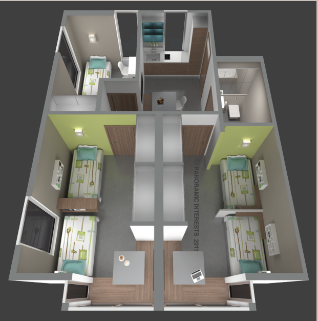
The Suite : 3 bedrooms & 5 twin beds