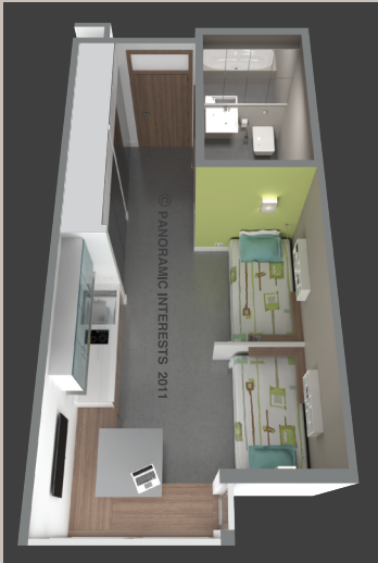
The Duo : two twin beds