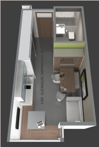
...switched to dining table