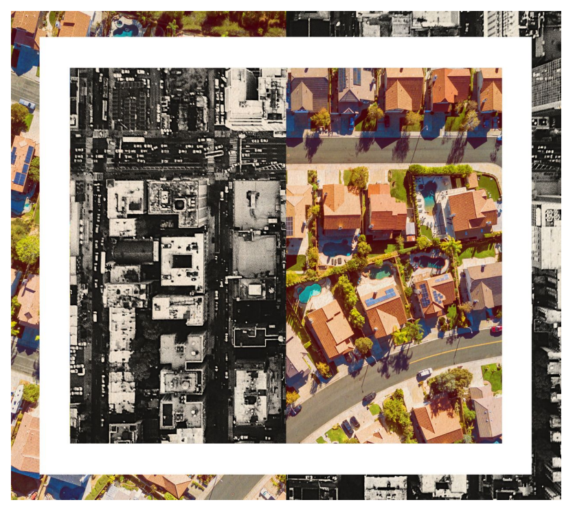
ILLUSTRATION: ALICIA TATONE

Lower taxes? Cheaper housing? Shorter commute? For some knowledge workers fleeing the big city amid the pandemic, the perks of relocating to a distant burg will soon grow stale.