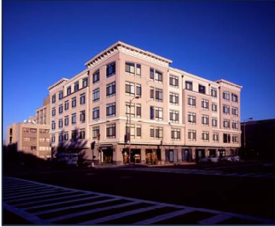
Berkeleyan Apartments 1910 Oxford Street