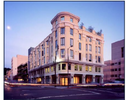
Artech Building 2002 Addison Street