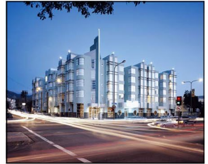
Fine Arts Building 2110 Haste Street