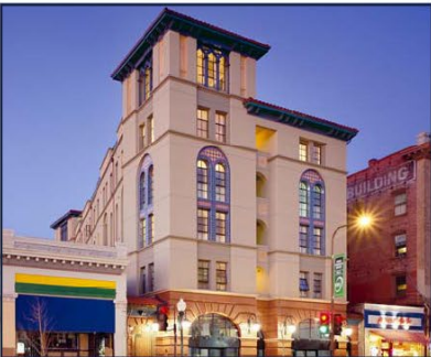
Bachenheimer Building 2119 University Avenue