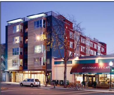
Touriel Building 2004 University Avenue