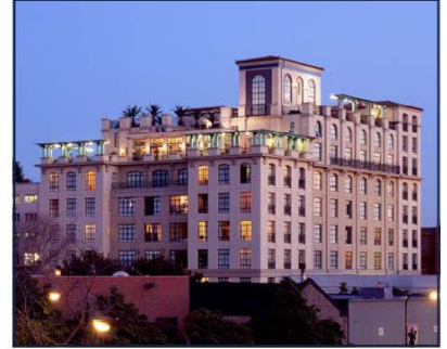
Gaia Building 2116 Allston Way