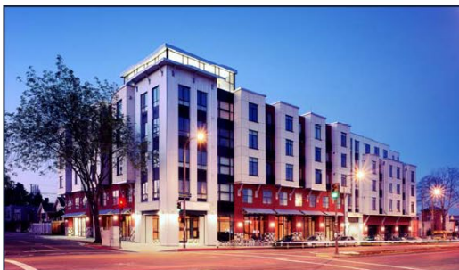
Acton Courtyard Apartments 1370 University Avenue