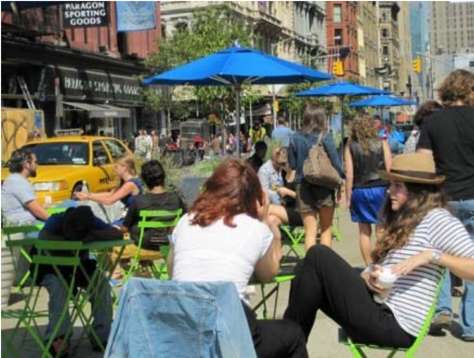
Union Square pedestrian plaza.

As many Americans find themselves migrating into cities, public-spaces-as-living-room are making a comeback. New York City is a prime example; the city has launched a number of public initiatives that have made the city into a great living room.