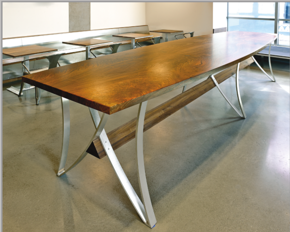
Lobby Lounge Community Table (14' book-matched clara walnut top, aluminum legs)