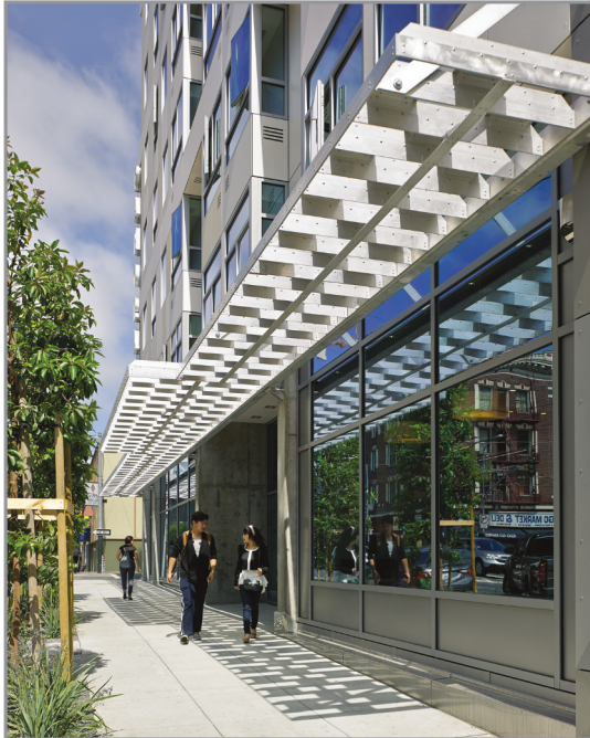
Interlude: Marquee and canopy (aluminum)

Artist at CITYSPACES ® 1321: The Panoramic