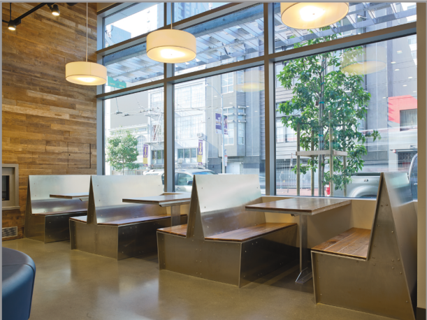
Lobby Seating Area Window Booths (aluminum, walnut)