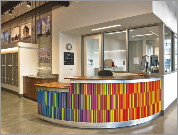
Lobby Foyer Radius Desk (aluminum, walnut, acrylic paint)