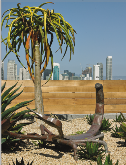
Rooftop Deck Garden Fauna (cast copper, copper sheet, & rivets)