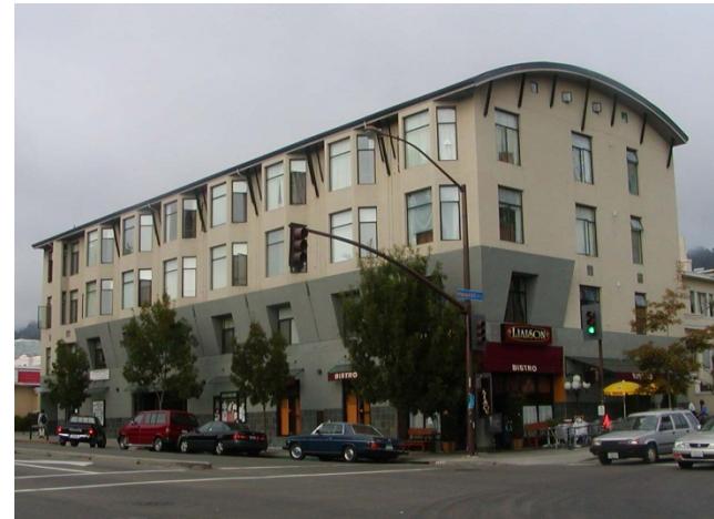
After Shattuck Lofts and Bistro Liaison, Berkeley, CA, 1995 (170 units/acre)