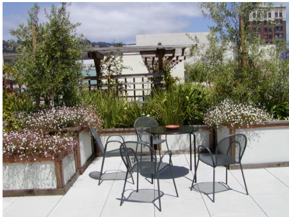
Roof Garden ARTech Building Berkeley, CA (1,450 s.f.)