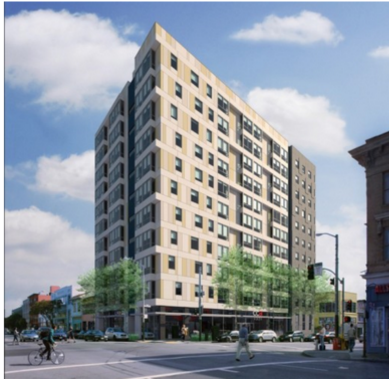
The Panoramic – 9 th and Mission – 160 Apts. – 0 Parking Spaces