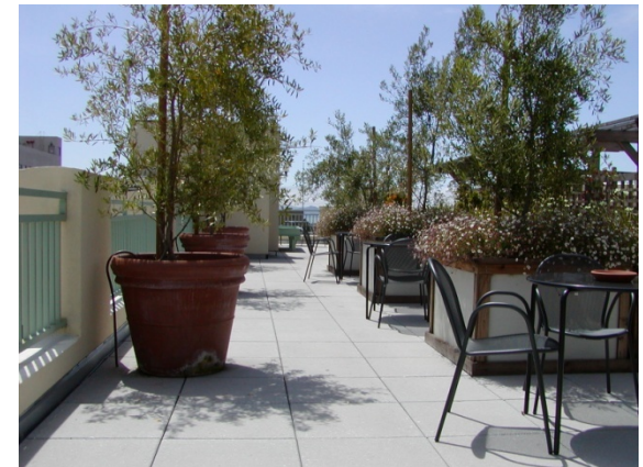
Roof Garden ARTech Building Berkeley, CA (1,450 s.f.)