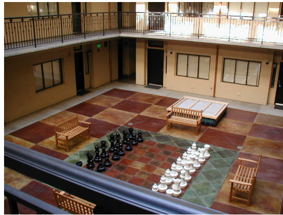
Atrium Chessboard Gaia Building, Berkeley, CA (1,200 s.f.)