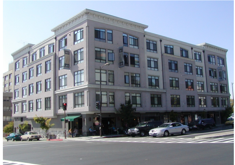
1910 Oxford – June 1998