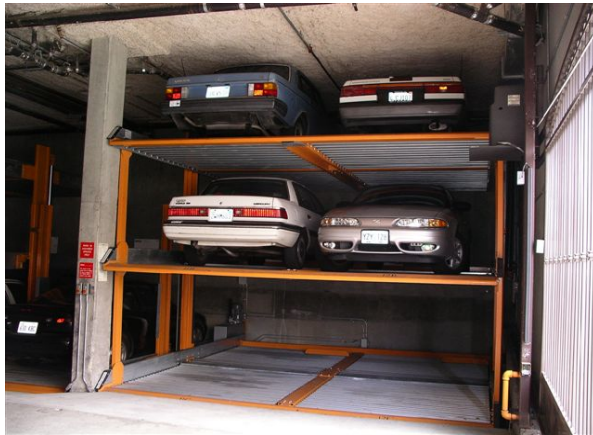
Triple-stack car-lift at the Berkeleyn, Berkeley, CA