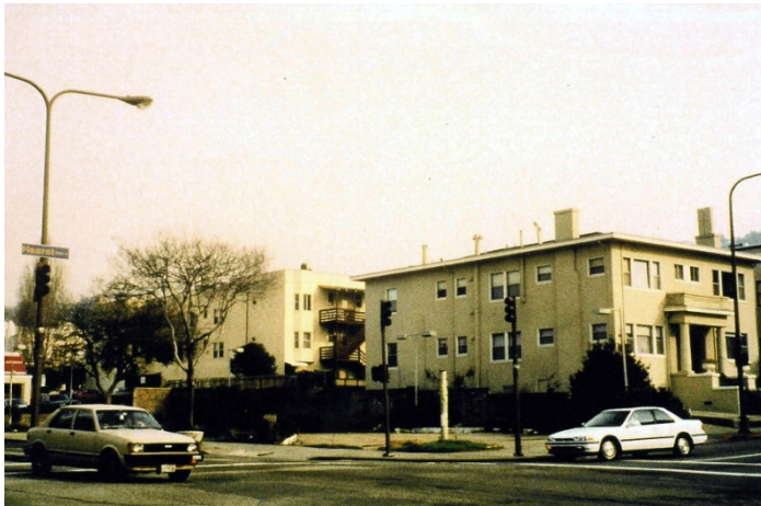
Before Berkeley, CA, 1993