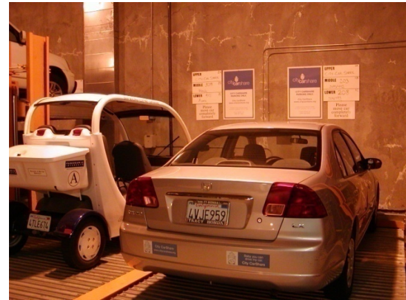
Electric car & City Care Share's Honda Civic at the Gaia Building in Berkeley, CA