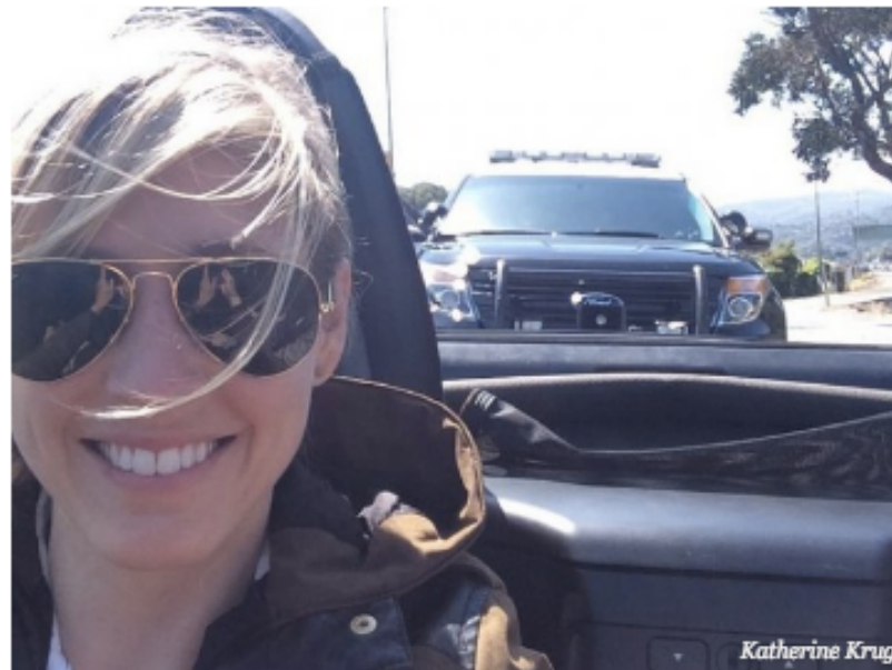
The author, shown here, is done paying for tickets.

My friends placed bets on how quickly I'd ditch my beloved Volkswagen Jetta for a bicycle, telling me about the bike lanes, the