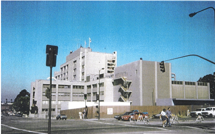
1910 Oxford – June 1997