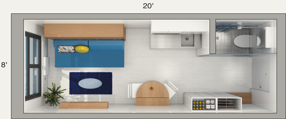
Each suite is furnished