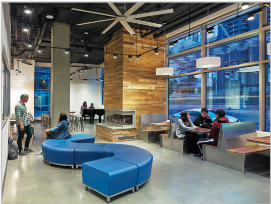
Lobby, Fireplace, & Lounge