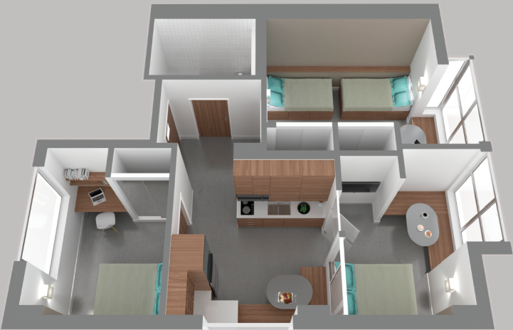
3 Bedroom Suite