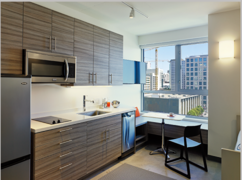
Studio, Kitchen and Living Area