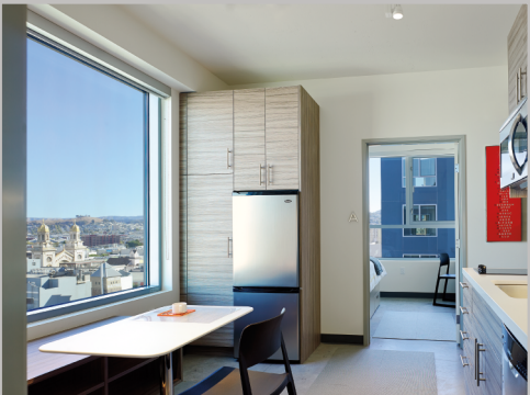
3 Bedroom Suite, Kitchen and Living Area