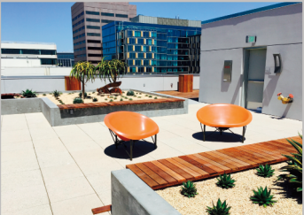
Roof Deck with Heated Seating