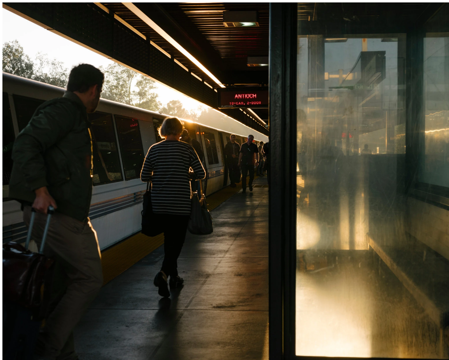
Commuters at the Lafayette BART station.

Nearly all of the biggest challenges in America are, at some level, a housing problem. Rising home costs are a major driver of segregation, inequality, and racial and generational wealth gaps. You can't talk about education or the shrinking middle class without talking about how much it costs to live near good schools and high-paying jobs. Transportation accounts for about a third of the nation's carbon dioxide emissions, so there's no serious plan for climate change that doesn't begin with a conversation about how to alter the urban landscape so that people can live closer to work.