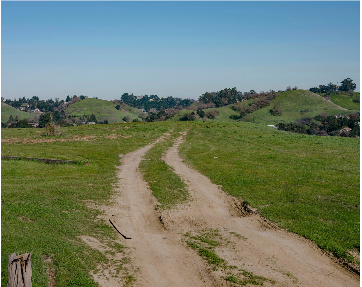
The contested parcel off Deer Hill Road. Just 30 minutes by rail from downtown San Francisco, the lot remains empty.