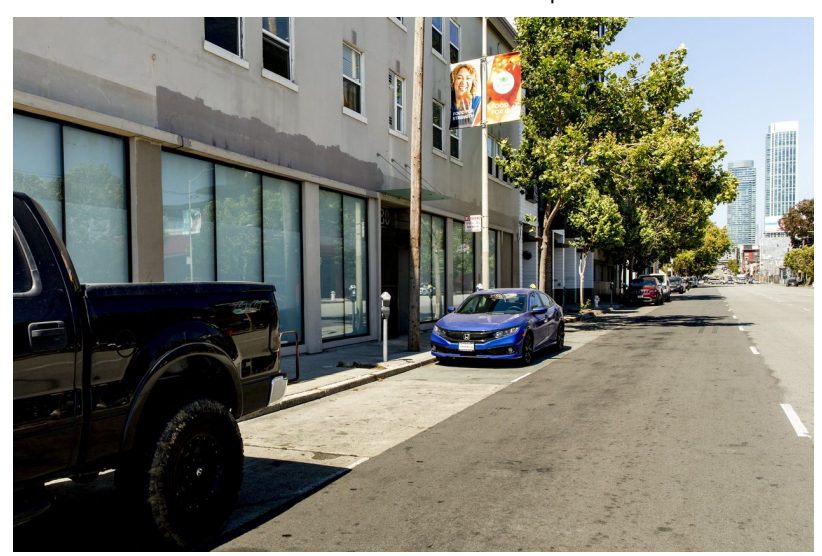
The San Francisco building where Chef Robotics has its offices.